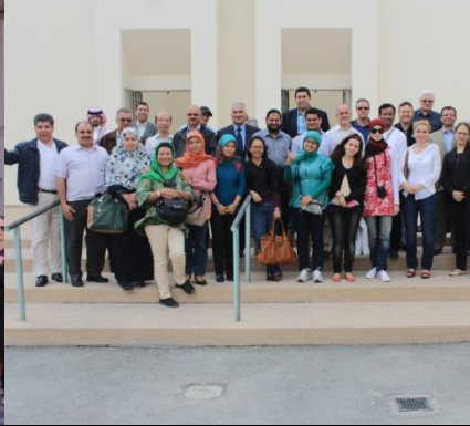
Qalat al Bahrain site and museum