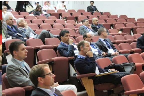
Hall 0-47 at the Administration Lobby