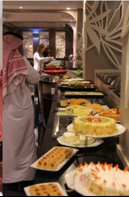
Conference Dinner (Golden Tulip, Manama, Bahrain)