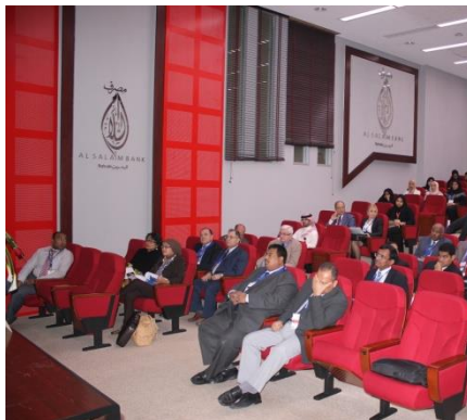
Al-Salam Hall (0-44) at the College of Business Administration