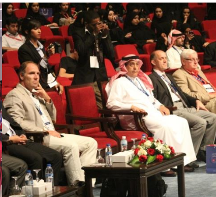
Shaikh Abdulaziz Hall