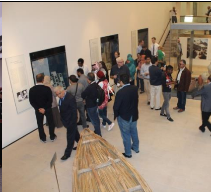
Qalat al Bahrain site and museum