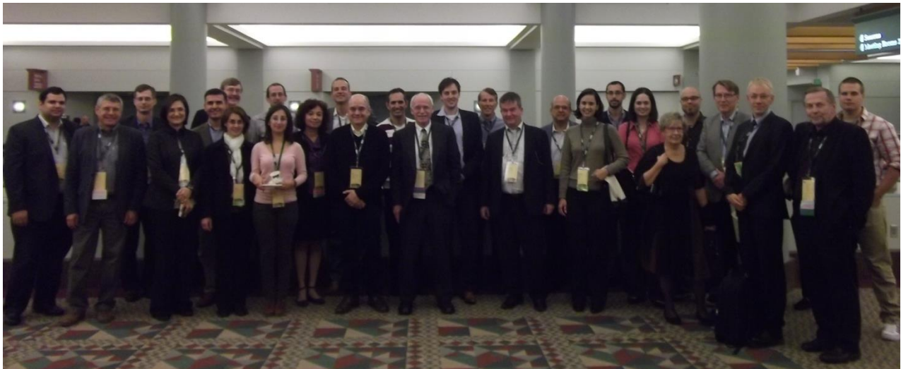
Group photo after the business meeting.