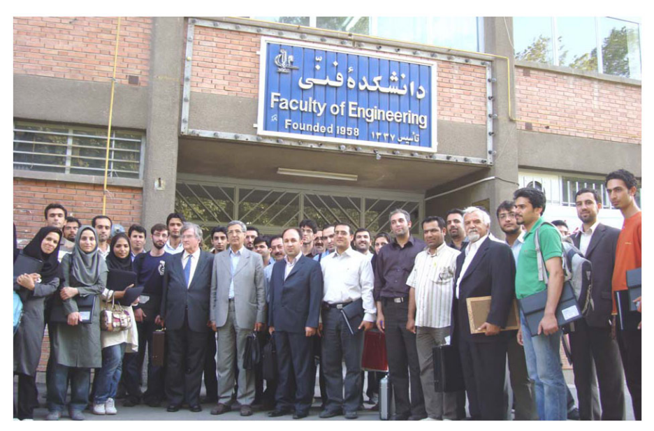
Participants of the workshop

Due to the high interest of the audience, the related workshops will be organized in the next years.