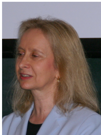
Prof. Anna Nagurney

The conference programme consisted of 125 talks in 39 parallel sessions and five plenary talks. Attendees came from over 40 countries in six continents. The spectrum of topics was wide, encompassing multiobjective optimization, decision support systems, auctions and games, fuzzy systems, applications in various fields, and problem structuring methods. Many colleagues reported on research related to the conference theme of "MCDM for sustainable energy and transportation systems". We could learn about renewable energy, management of natural resources, and sustainable development. Eight of the talks were presented in two sessions of a special track on Multiobjective Evolutionary Algorithms, a novelty at this MCDM conference. The EMO track was organised by Boris Naujoks of the University of Dortmund, Germany.