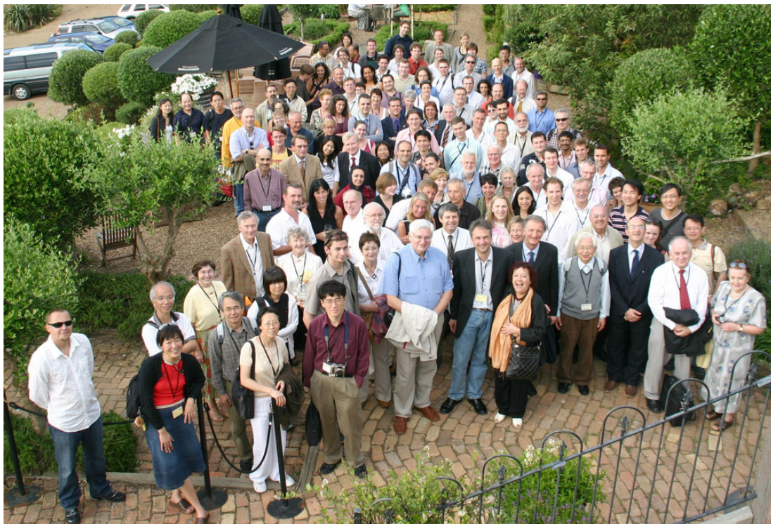
The delegates of MCDM 2008 at Mudbrick Vineyard

In its 33 year history the International Conference on Multiple Criteria Decision Making venues first followed a zigzagging itinerary between Europe and North America before venturing to cities in other continents (Kyoto, Taipei, and Cape Town). Finally, in its 19th edition the conference reached “the most beautiful end of the world” (as New Zealand is often promoted by the travel industry). Also known as the city of sails, Auckland boasts the tallest building in the southern hemisphere and 50 volcanoes among its attractions. As conference chairmen I am honoured that Auckland has been selected as only the second venue for the conference in the southern hemisphere.